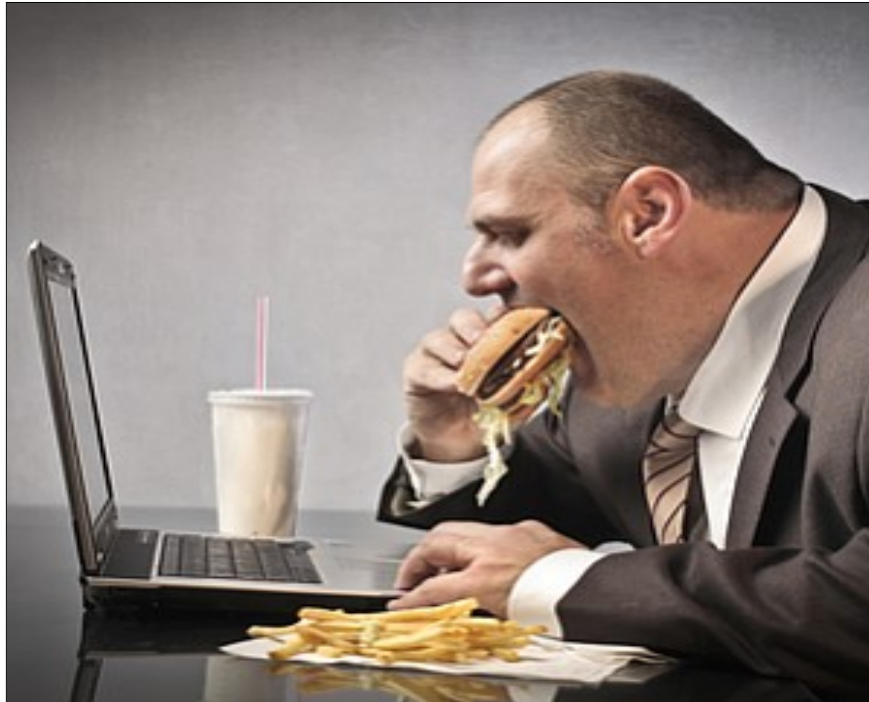
Figure 2. Obesity and metabolic syndrome induced of computer overuse

Computer and internet overuses increase sedentary time and inactivity which impact on body weight as well as body mass index (BMI) at which can cause overweight and obesity conditions in different individual [12]. Computational technological changes will raise obesity and associated illness. Long term sitting following long-term computer use increase appetites and reduce the desire of being active so that the fat layer accumulate in body in part in the abdomen (belly) first and induce different level of obesity (Figure 2). At the subsequent time, serious health condition such as cardiovascular and heart diseases, metabolic syndrome, high blood pressures cancers can appear in long – terms [13]. Consequently, additional cost of obesity in different health setting statistically is very high and account for heavy burden on global economic. More importantly, morbidity and mortality associated with obesity are enhancing per second per year [14].