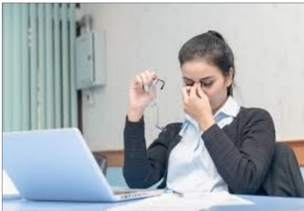
Figure 3. Computer vision syndrome