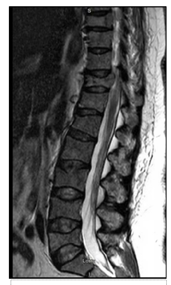
IMAGE 2. Several pathologic compression and burst fractures throughout the spine. Ventral cord indentation at T1, T8 and T11. Rostrocaudal cord edema spanning T10-T12 secondary to more significant cord compression. Bulky left paraspinal osseous/extraosseous disease at T8 (arrow) causing potential impingement.

on type of MM<sup>5</sup>. Low AG is commonly observed in IgG myeloma due to its cationic property <sup>5</sup>. In contrast, IgA myeloma can have an increased or а normal AG attributed to its anionic property <sup>5</sup>. Pseudohyperphosphatemia, not а widely known phenomenon, can result from laboratory error <sup>2,3</sup>. Paraproteinemias can also result in pseudohyponatremia due to the reduction in the plasma water fraction secondary to increased total protein concentration. Our case not only demonstrates an unusual presentation of MM with increased AG but also highlights the importance of recognizing paraproteinemias as a potential source of before discrepant laboratory results instituting