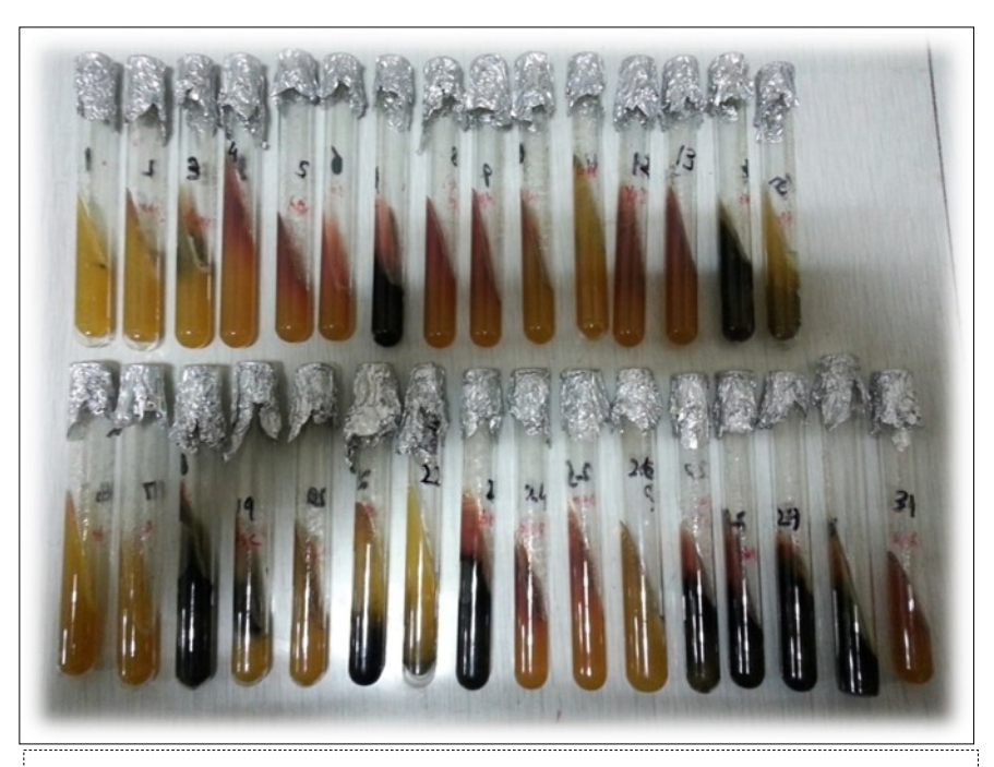
Figure 3. TSI Slants showing different butt and slant color patterns. Glucose, sucrose and lactose fermentation ability of different bacteria help to identify their genera on the basis of patterns of colour changes in butt and slant. This test also help to identify gas producers and H2S producing bacteria as well.

Figure 2. Streak plating of bacterial on their respective differential medium. A= Staphylococcus aureus on Staph 110 agar, B= Salmonella spp. on Salmonella-Shigella agar, C= E. coli on MacConkey's agarand D= Bacillus subtilis on Eosin methylene blue agar