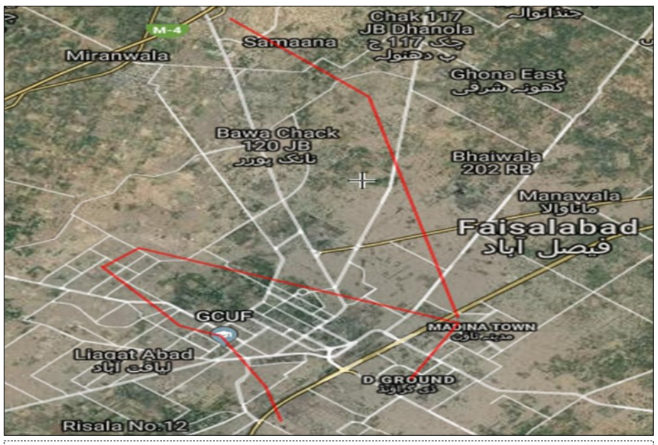
Figure 1. Eight different towns of district Faisalabad. Red lines indicate the tract of 8 towns for sample collection