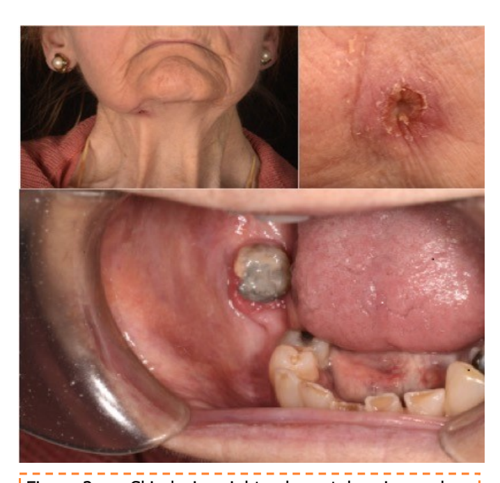
Figure 2a-c: Skin lesion right submental region and intra-oral examination finding

This case was an 87-year-old Caucasian lady was also referred to the ENT department for a right sided submandibulectomy by her local Otolaryngologist. On examination, there was a 1cm raised erythematous plaque, which was tethered to the underlying mandible. Intraoral examination revealed a problematic right molar tooth (Fig 2a-c). On suspicion of an infected dental sinus as the cause of her symptoms, an OPG was performed and the patient was referred to the craniofacial unit afterwards. We performed an extraction of the lower right 5 and biopsied the skin lesion. The microbiology results were similar to those