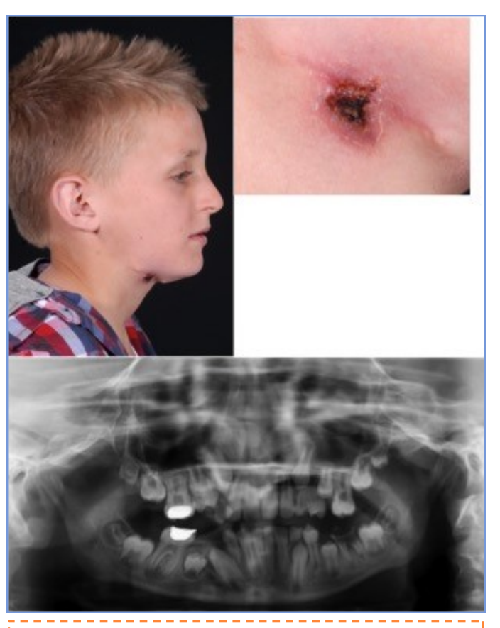
Figure 3a-c: Skin lesion right submental area, OPG mixed dentition with moderately restored LR6 and UR6, a big cavity around the LL6 and periapical radio-lucany around LR6

On clinical examination, the lesion was 1cm in diameter and was located in the submandibular region on the right side. A 2.5 cm scar after attempted excision of the skin lesion was noted. A thorough history revealed, from the patient and his parents, multiple dental problems and treatments in the past (Fig. 3 a-b). The patient was then referred to our department.