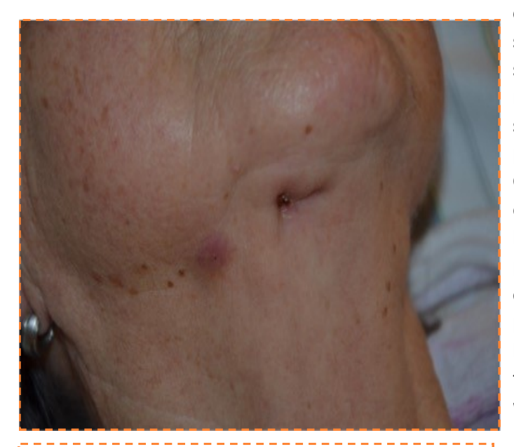
Figure 5.: Chronic infection and fistula on the right submental/submandibular side

This case was referred from the dermatologists and was a 38-year-old male complaining of a purulent discharge from a non-healing wound on the right cheek (Fig. 4). The patient thought the lesion was due to his shaving technique, but noted no improvement after changing to an electric razor from a hand held razor.