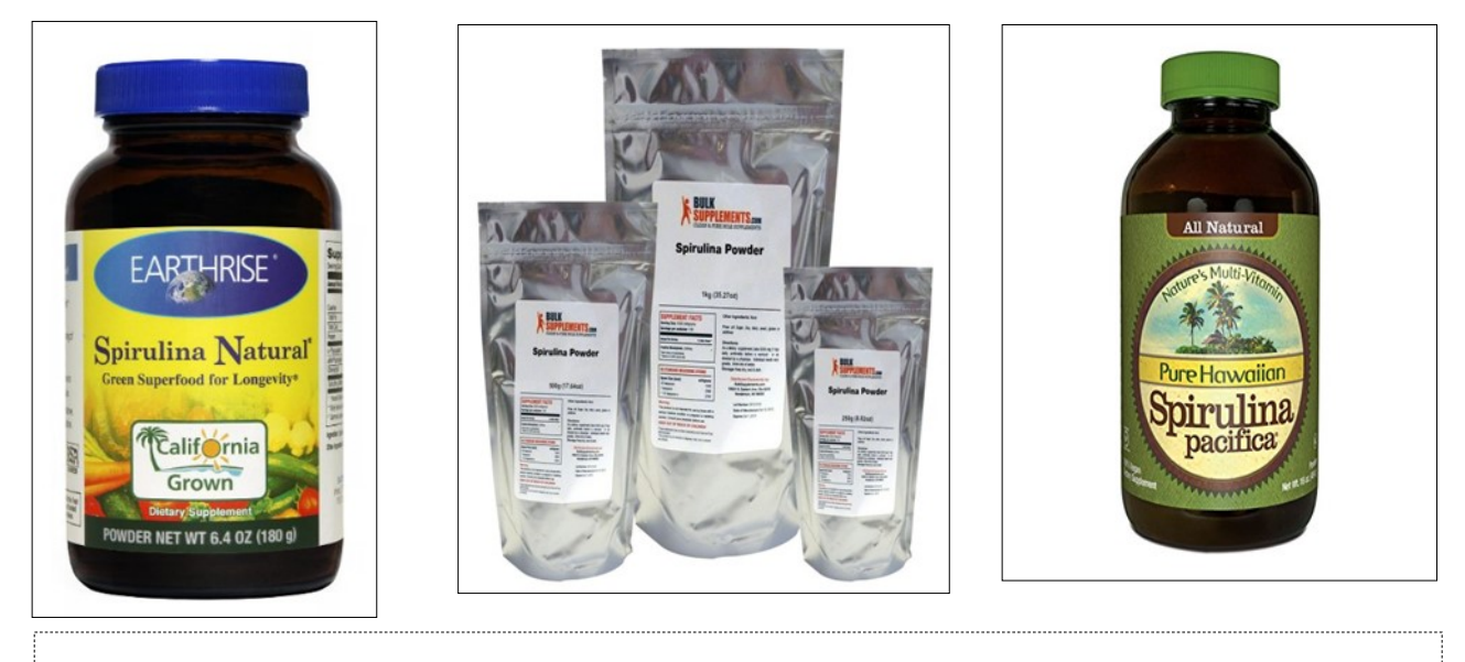
Fig. 3Different Spirulina brands by Companies [142, 144, 143]

Fig. 2 The finished products. Protien pellets on the left, bio-diesel in the middle and omega 3 oil on the right. (Aurora algae) [141]