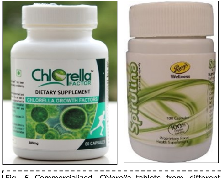
Fig. 6 Commercialized Chlorella tablets from different companies [152]

-India based food company with specialization in harvesting, production and marketing of Spirulina .