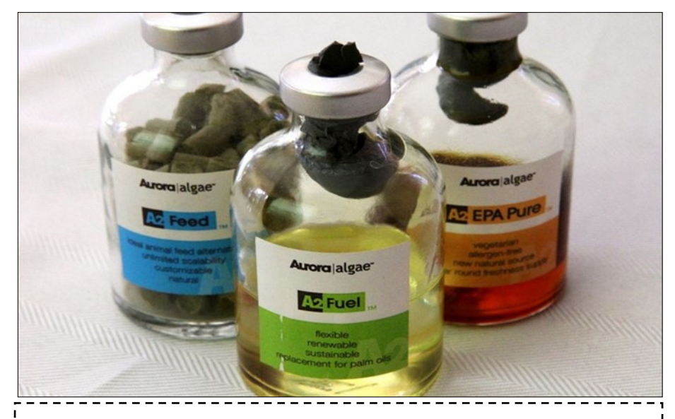
Fig. 2 The finished products. Protien pellets on the left, bio-diesel in the middle and omega 3 oil on the right. (Aurora algae) [141]