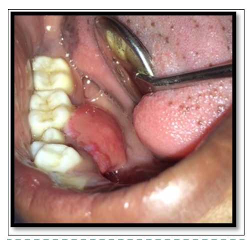
Fig 1: Pre operative size and extent of lesion

During the next visit local anesthesia was given.