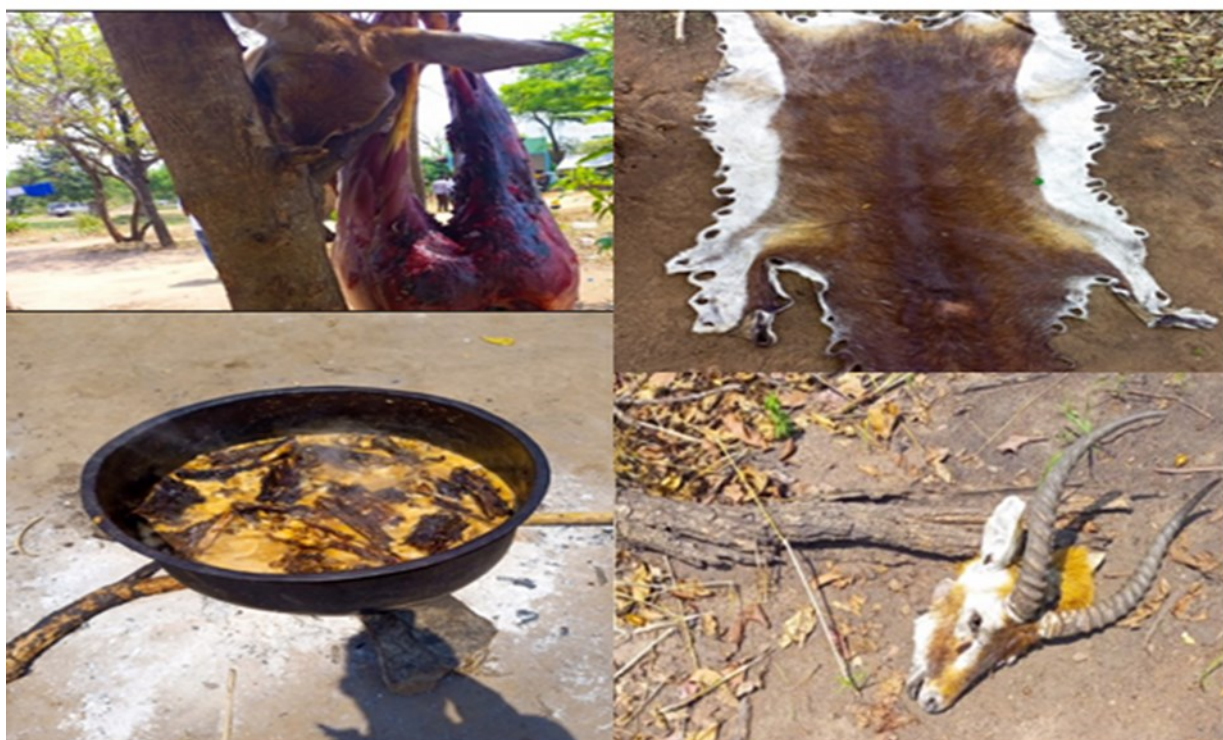
Figure 4. White-eared kob bush meat collected through hunting

Both refugees and some military personnel in Gambella Regional State have had a negative impact on the park's wildlife resources. The type of hunting in the region is also changing to automatic weapons [11]. The traditional methods of wildlife hunting, such as setting traps and snares, are no longer sustainable as the reasons for hunting in the region are largely shifting from subsistence to commercial