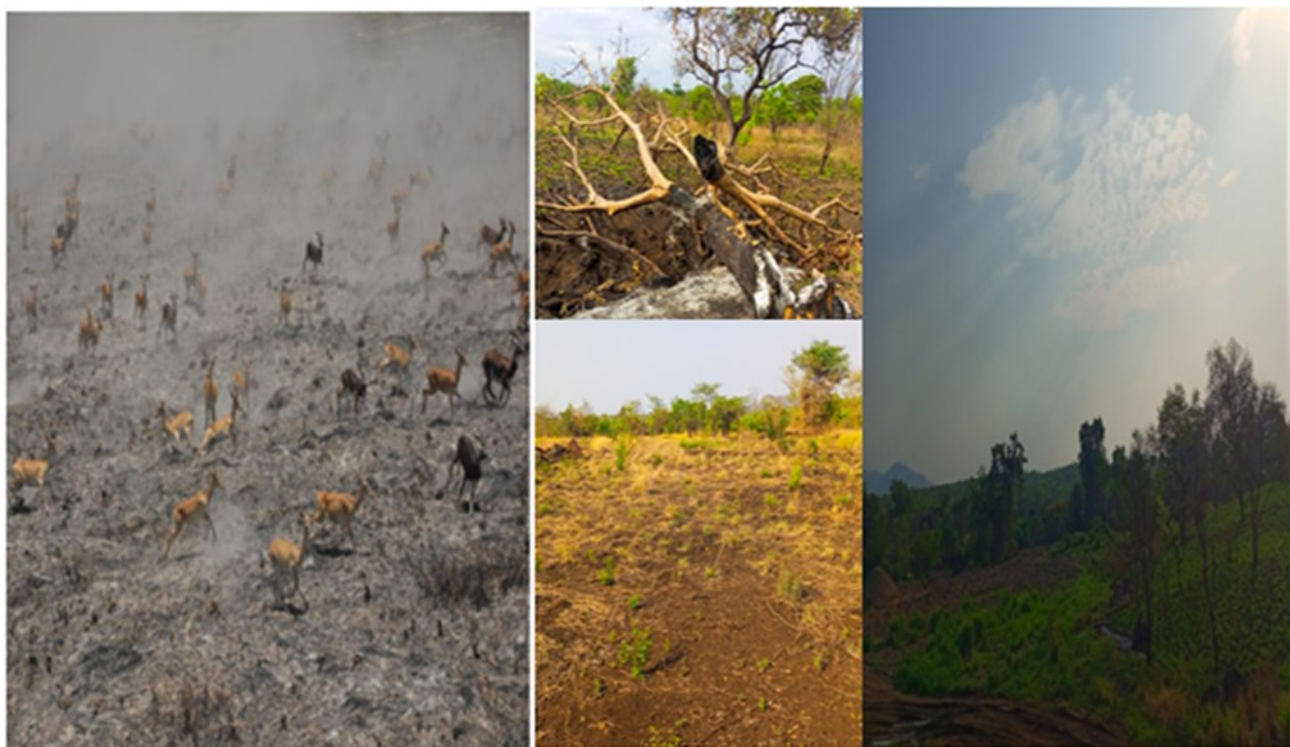
Figure 5. White-eared kobs during peak fire season in Gambella National Park (Kassahun Abera, 2018).

In most parts of Ethiopia, particularly in the Gambella region, the failure to consider “rural land rights” was identified as a core problem, leading to competition for land use rights between small farmers and all state institutions associated with the socio-economic expansion Coping with disruptions and developing LSAI in Ethiopia [5]. The results of LSAI have been a controversial topic in public and hypothetical discourses, especially regarding the quantification of the impact of such investments on