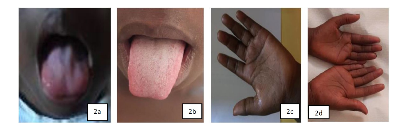
Figure 2. Hunter's Glossite (2a); Disappearance of Hunter's Glossitis (2b); Melanoderma (2c); Normal skin appearance after treatment (2d)

D0= Day0; W1=week1; M1-3= first three months of follow-up; MCV=Corpuscular Volume; MCHC= Corpuscular Hemoglobin Concentration; MCH =Mean Corpuscular Hemoglobin Mean.