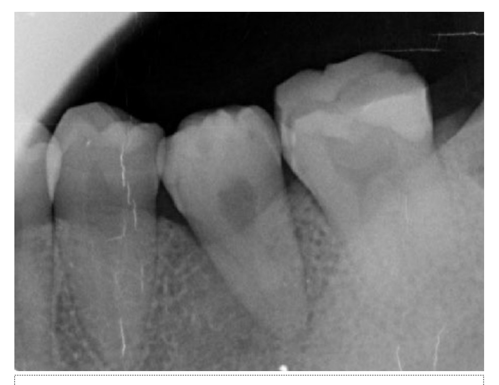
Figure 10.Clinical case of left autotransplantation

Bone regeneration around the grafted tooth was confirmed.