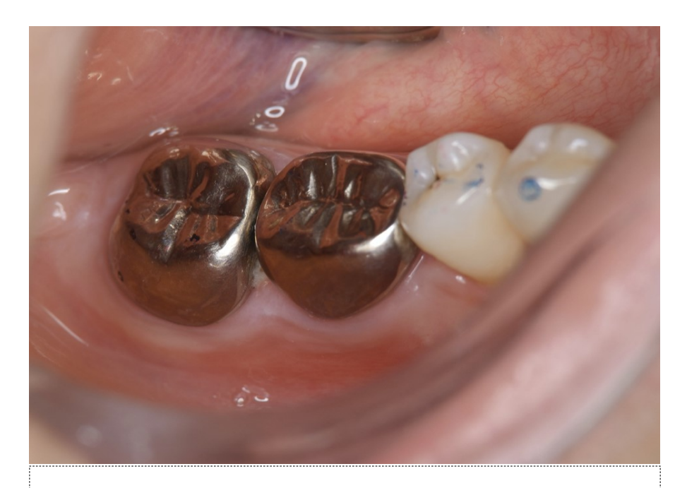
Figure 7. Inter-oral photo obtained after treatment.

Full metal crowns were inserted for #46, #47. Pathological mobility and bleeding on probing were not seen, and the transplanted tooth showed good function.