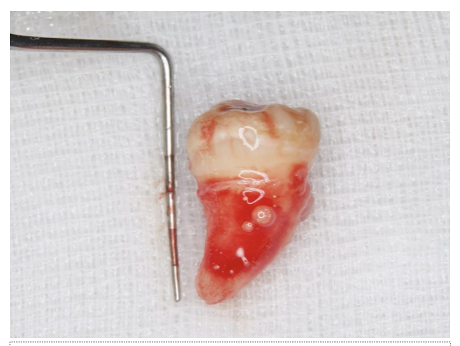
Figure 9. Dental X-ray image obtained two years after transplantation.

Bone regeneration around the grafted tooth was confirmed.