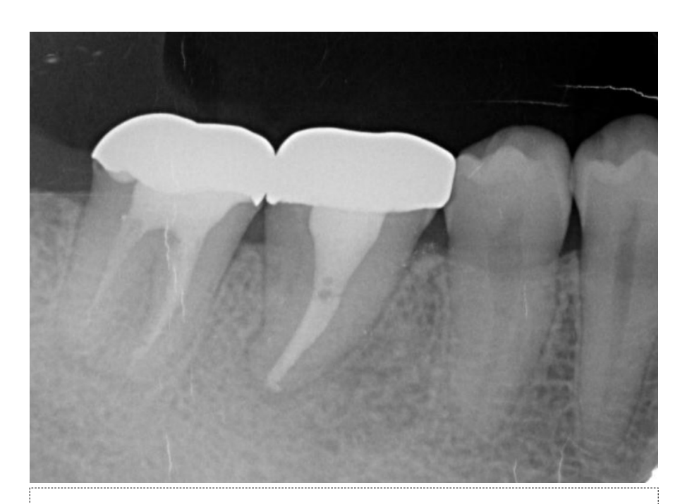
Figure 8. Cone beam CT image obtained after transplantation.

Full metal crowns were inserted for #46, #47. Pathological mobility and bleeding on probing were not seen, and the transplanted tooth showed good function.