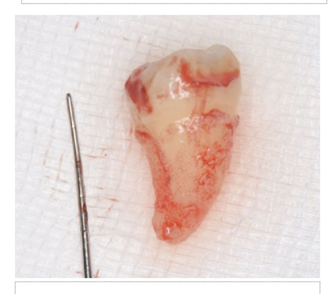
Figure 4. Extraction of #48 was performed without damaging the periodontal ligament.

A metal crown was inserted at #46 and bleeding on probing during the periodontal pocket examination was noted.