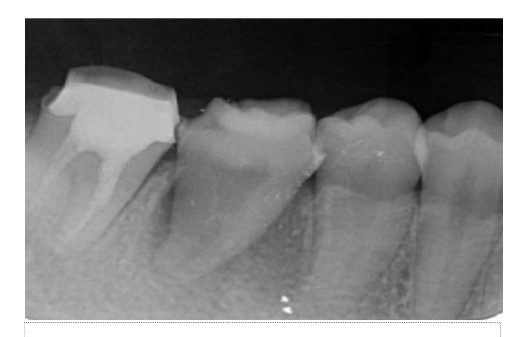
Figure 6. Dental X-ray image obtained after transplantation.

The metal crown for #47 was also detached during tooth extraction.