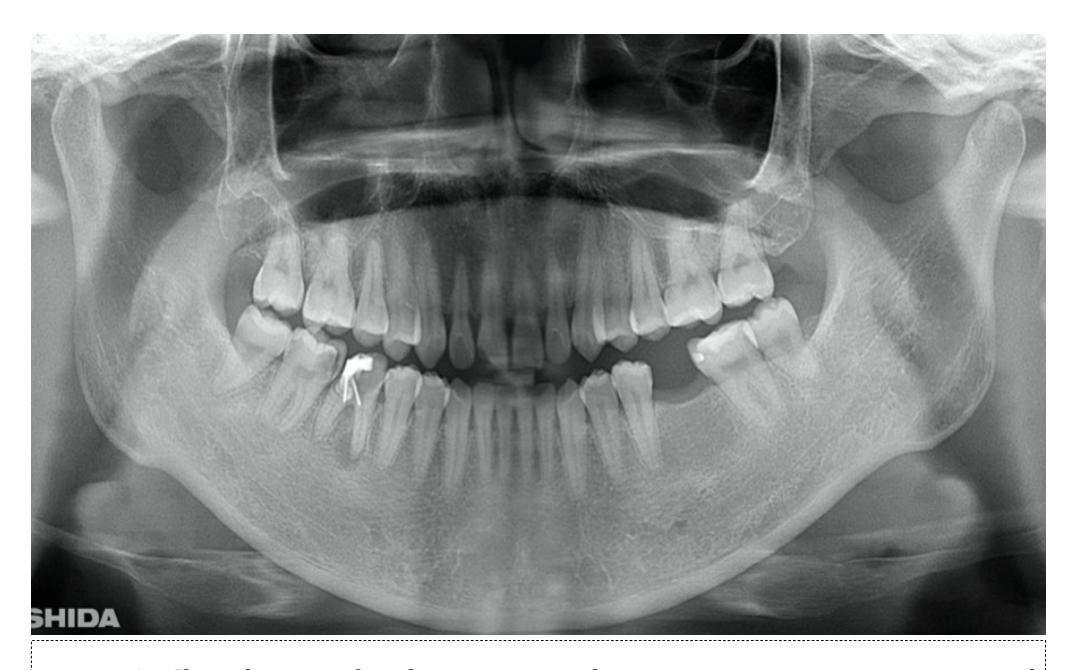
Figure 1. Clinical case of right auto transplantation. Panoramic view at initial examination.

Tooth #46 was shown to be half decayed and a cystic lesion was found in the mesial root apex. Tooth #36 was lost, while #48 and #38 were present. There was a total of 29 teeth in the oral cavity.