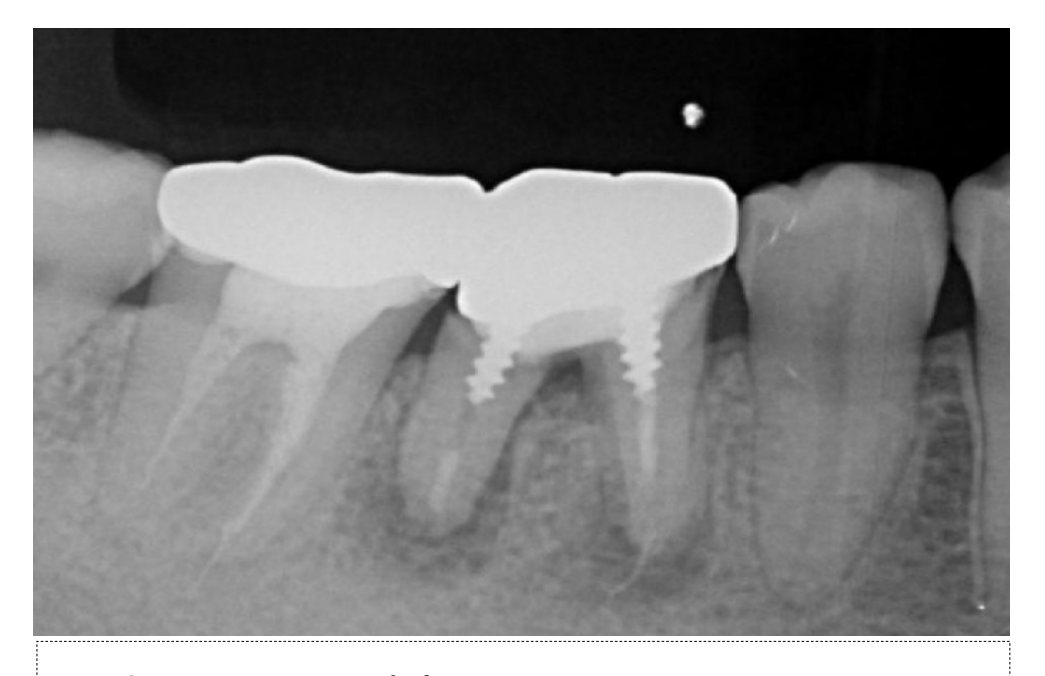
Figure 2. Pre-treatment X-ray findings.

Tooth #46 was shown to be half decayed and a cystic lesion was found in the mesial root apex. Tooth #36 was lost, while #48 and #38 were present. There was a total of 29 teeth in the oral cavity.