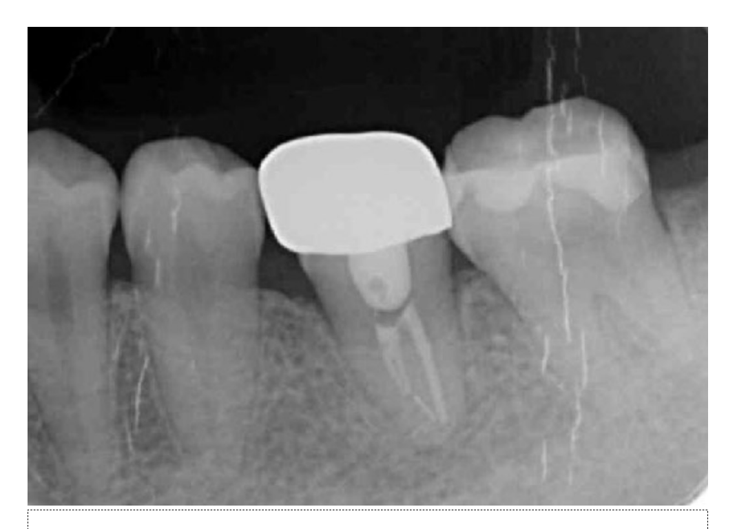
Figure 12. Intraoral photo obtained after setting the donor tooth into the socket of the recipient.