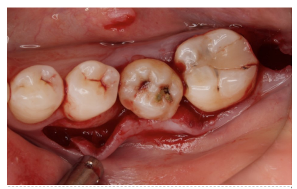
Figure 11. Dental X-ray image obtained after autotransplantation from #38 to #36. The donor tooth root canal appeared to be blanched.