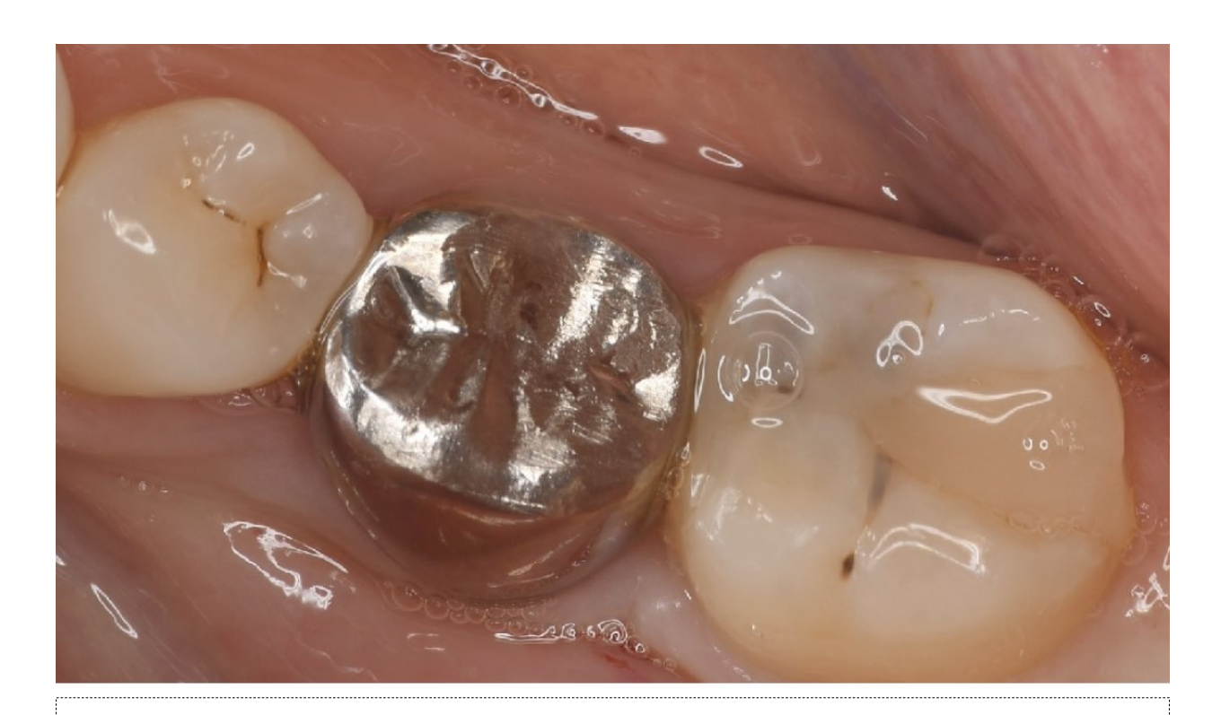
Figure 13. Dental X-ray image obtained after confirmation of definitive prosthesis. Bone regeneration can be seen around the root of the donor tooth.