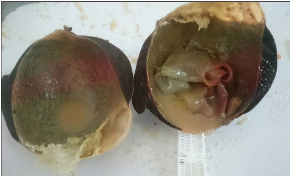
Figure 2. Shows cut section macroscopic of splenic hydatid cyst in centre there is hydatid membranes white.