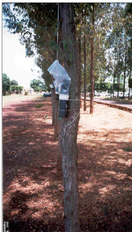
Figure 2. General appearance of the trap.