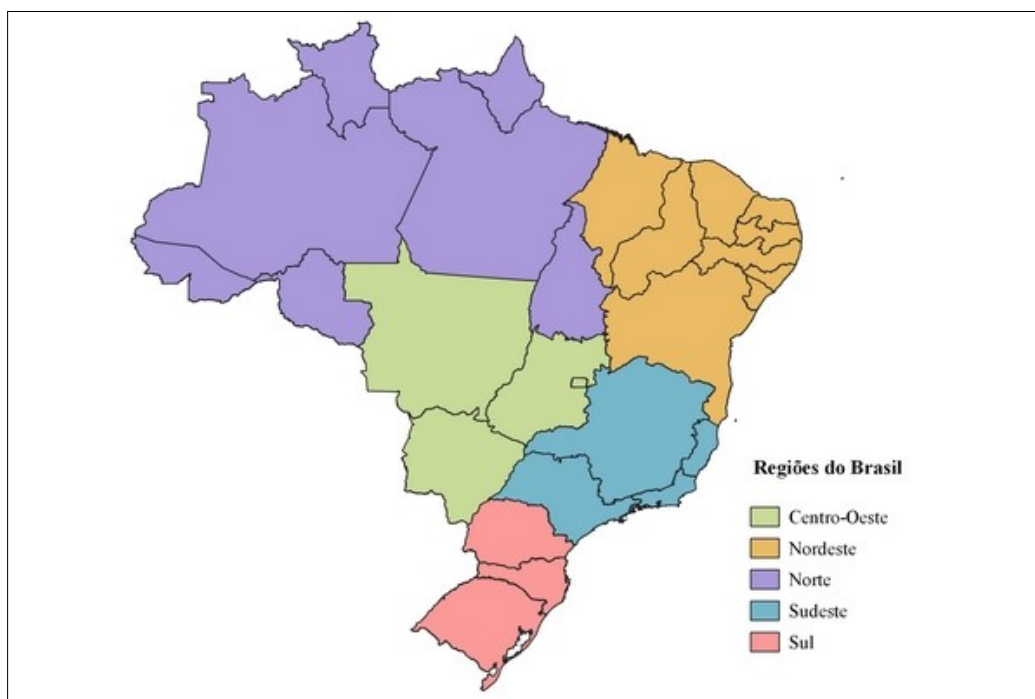
Figure 1. Map of Brazil: and their regions - Midwestern Region green color.