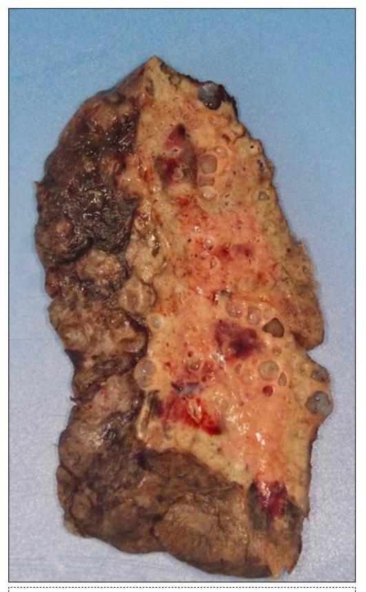
Damaged lung removed Figure 2. following transplantation. Northwestern Medicine

DOI: 10.14302/issn.2693-1176.ijgh-20-3546