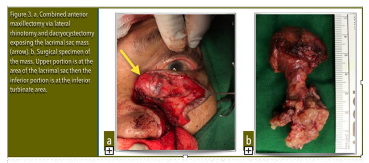
Figure 3. a. Combined anterior maxillectomy via lateral rhinotomy and dacryocystectomy exposing the lacrimal sac mass (arrow). b. Surgical specimen of the mass. Upper portion is at the area of the lacrimal sac then the inferior portion is at the inferior turbinate area.

DOI: 10.14302/issn.2470-0436.jos-19-2998