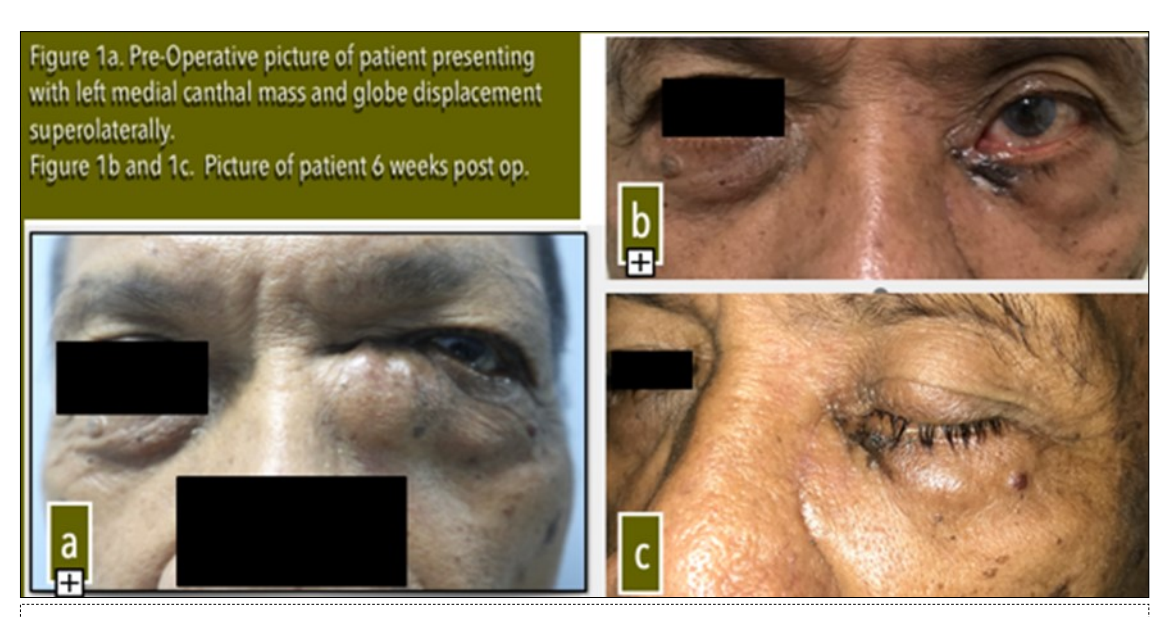
Figure 1a. Pre-Operative picture of patient presenting with left medial canthal mass and globe displacement superolaterally.

The lesion was completely excised by combined surgical management of anterior maxillectomy via lateral rhinotomy approach and dacryocystectomy [Figure 3a and b]. Intraoperatively, there was note of adhesions to