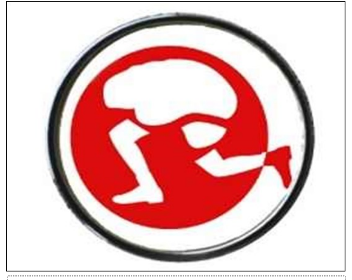
Figure 2. Beneficial implications to activate the brain

activity which easily can cause the brain to release hormeses such as endorphins which decreases mental stresses and improves mind effectiveness. Further, walking activity as enhances the oxygen supply in brain space, promotes optimal brain workouts [5]. Likewise, listening to a desirable sound of music will advocate the center of attentions [6]. More importantly, good nutrients consumptions and drinking enough water strengthen the brain cells for more powerful performances at any tasks or movements at each day [7] (Fig2).