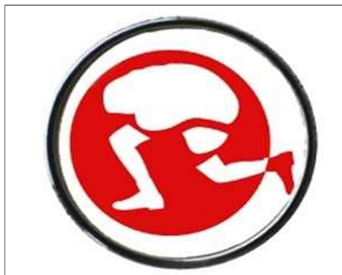
Figure 2. Beneficial implications to activate the brain

activity which easily can cause the brain to release hormones such as endorphins which decreases mental stresses and improves mind effectiveness. Further, walking activity as enhances the oxygen supply in brain space, promotes optimal brain workouts [5]. Likewise, listening to a desirable sound of music will advocate the center of attentions [6]. More importantly, good nutrients consumptions and drinking enough water strengthen the brain cells for more powerful performances at any tasks or movements at each day [7] (Fig2).