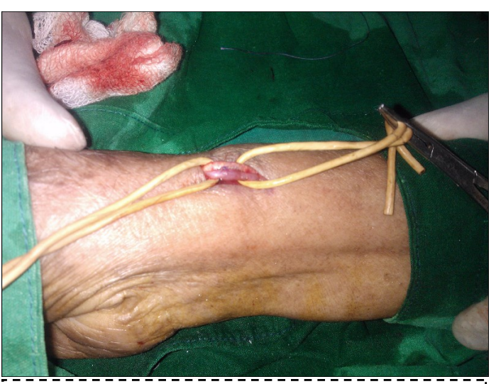
Figure 1: Partially calcified right radial artery is seen lying lateral to the cephalic vein at right anatomical snuff box. A successful side to side anastomosis between the aberrant radial artery and cephalic vein was performed.

An adequately functioning AVF has an important role in clinical course of CKD patients on MHD. It is very