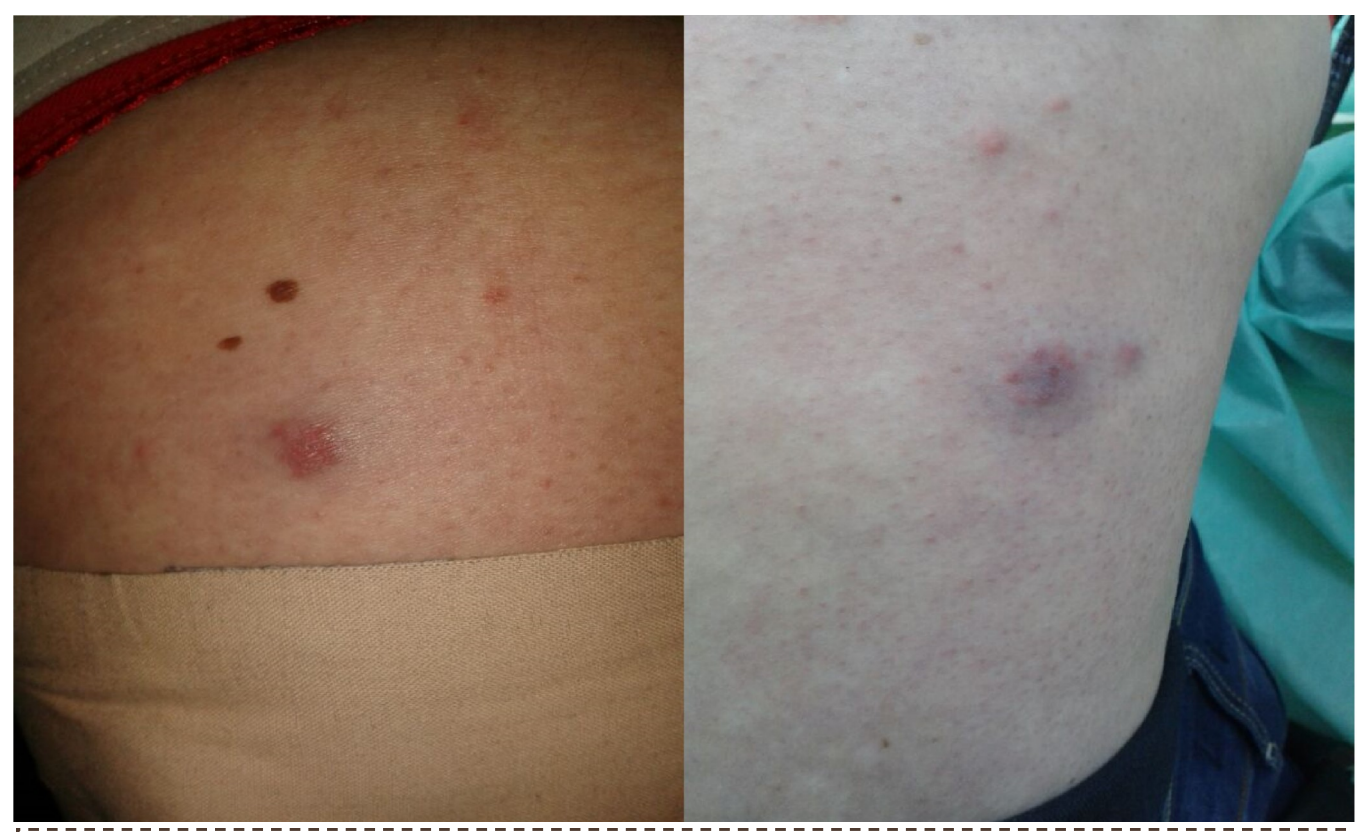
Figure 1. Erythematous-to-violaceous, edematous, inflammatory, and tender papules and plaques on both ¦ thighs